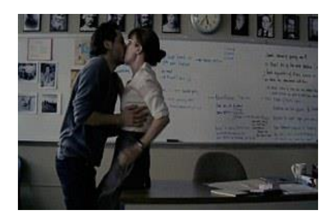
Figure 5.4 Visuals in Ms. Sinclair's Classroom

Additionally, the materials she has put on the walls might be used in Materials Development courses to suggest ways of teaching with visual materials for prospective English teachers.