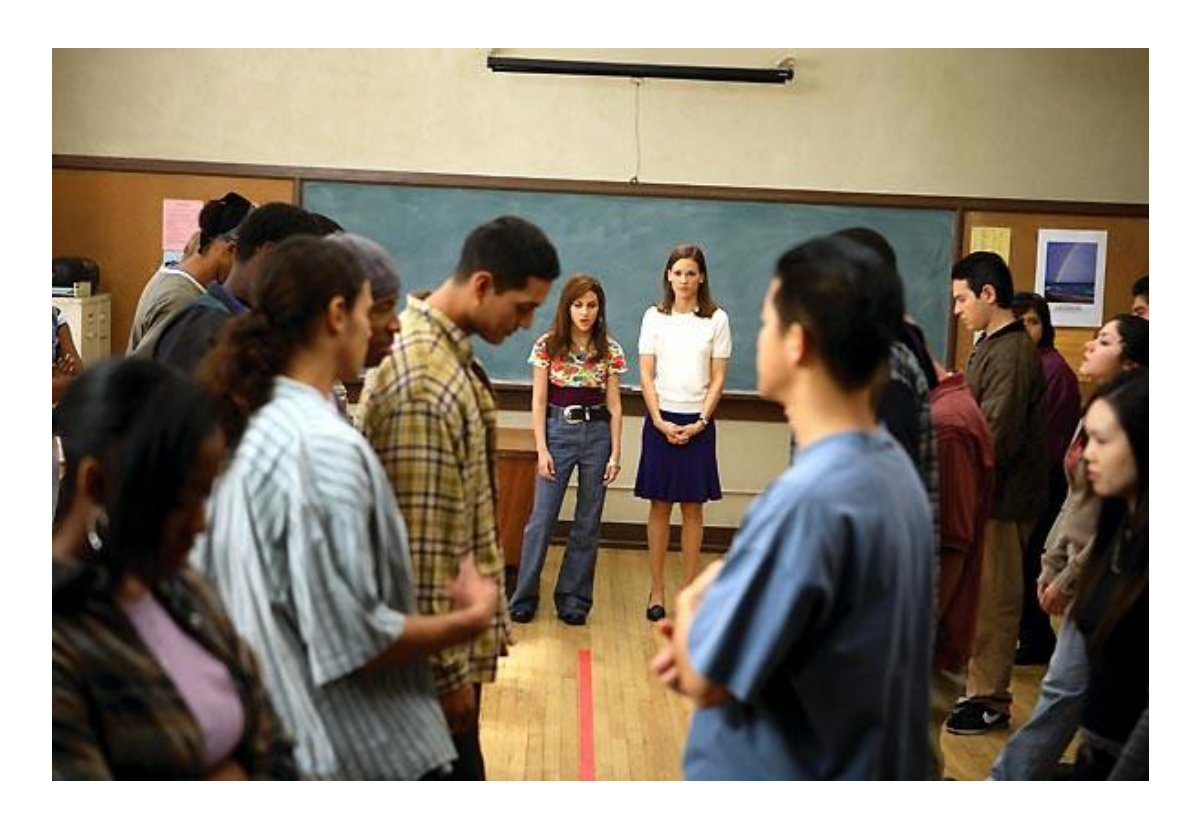
Figure 5.1 The Line Game

The game that the English teacher Erin Gruwell sets up in her class is called the Line Game. In this activity, the teacher draws a line in the middle of the classroom, and the students are divided into two groups standing on either side of this line. The teacher then asks successive questions and expects the students to come close to the line if their answer to the question is positive. After each question, the students move back to wait for the next one.