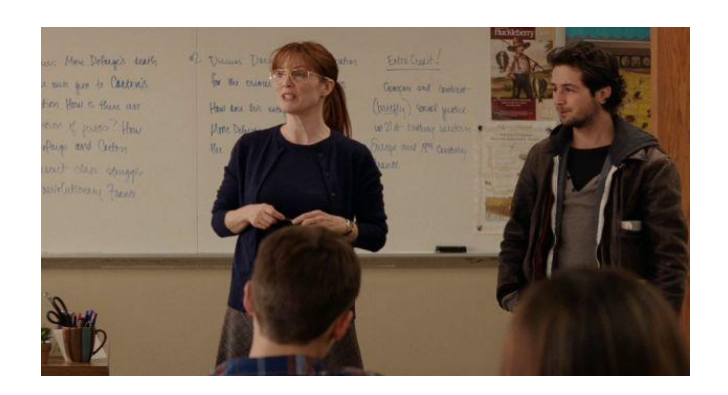
Figure 5.5 Visuals in Ms. Sinclair's Classroom