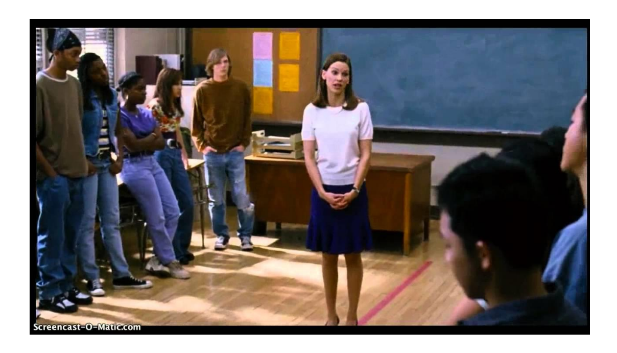
Figure 5.2 The Line Game