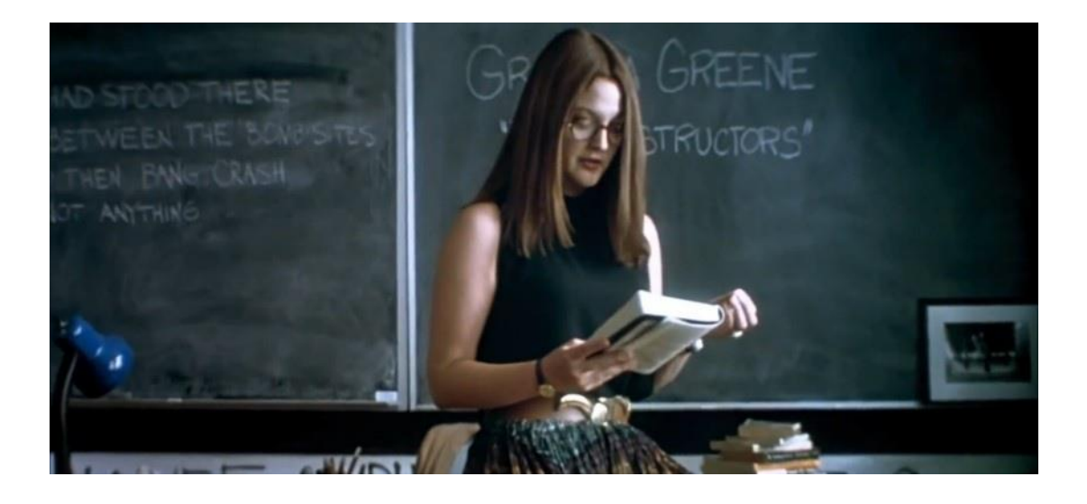
Figure 4.6 Ms. Pomeroy's Classroom

less tragic than another?" (Fields, Juvonen, & Kelly, 2001).