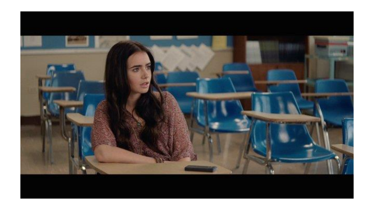
Figure 5.3 Visuals in Ms. Sinclair's Classroom

Additionally, the materials she has put on the walls might be used in Materials Development courses to suggest ways of teaching with visual materials for prospective English teachers.